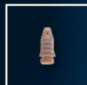
Actual Size: 2.8mm