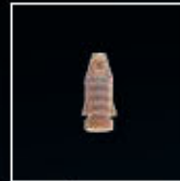
Actual Size: 2.8mm

The 2.8mm design boasts the smallest size double loaded knotless anchor available on the market!